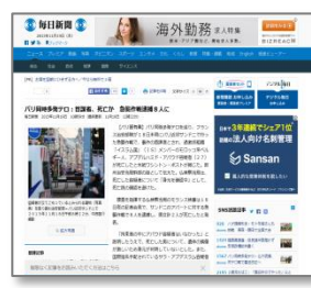
Web-site "The Mainichi"