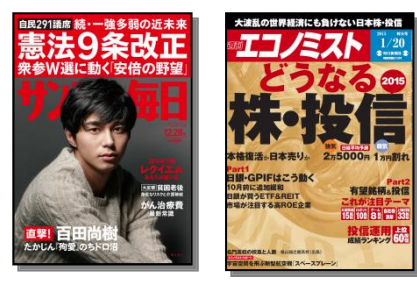
"The Sunday Mainichi" magazine. "The Weekly Economist" magazine.