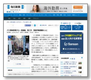
Web-site "The Mainichi"