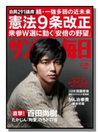
"The Sunday Mainichi" magazine.