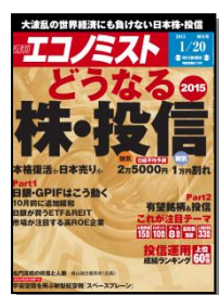
"The Weekly Economist" magazine.