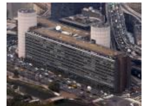
Mainichi Newspaper Tokyo-headquarters.

Color ads : Four-color ads available Double-Page : Available Pre-printed inserts : Unavailable Type page : 380mm width × 511mm height Print : Offset and letterpress Number of columns : 15 horizontal columns Ad closing dates : Black and white ads (Screen: 140 lpi) 2 days prior to publication Color ads (Screen: 200 lpi) 5 days prior to publication File Format : EPS (Adobe Post script level 2) PDF (PDF x1/a)